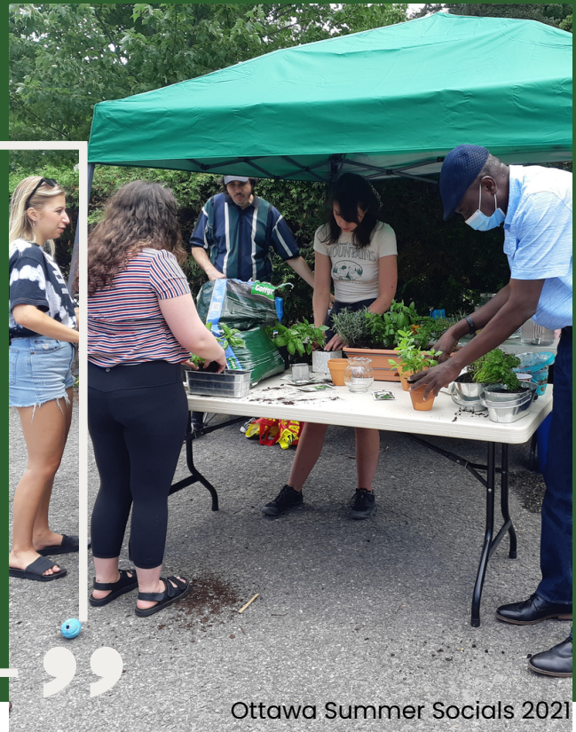
Ottawa Summer Socials 2021